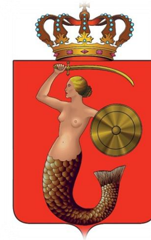
Emblem of Warsaw