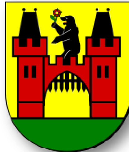
Emblem of Ursynów - district where we live in