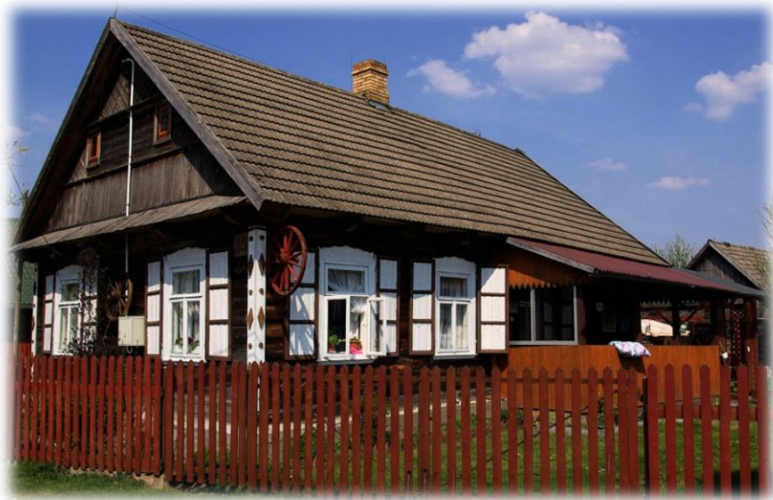
Traditional Polish houses in Bieszczady, Mountains and Białowieża