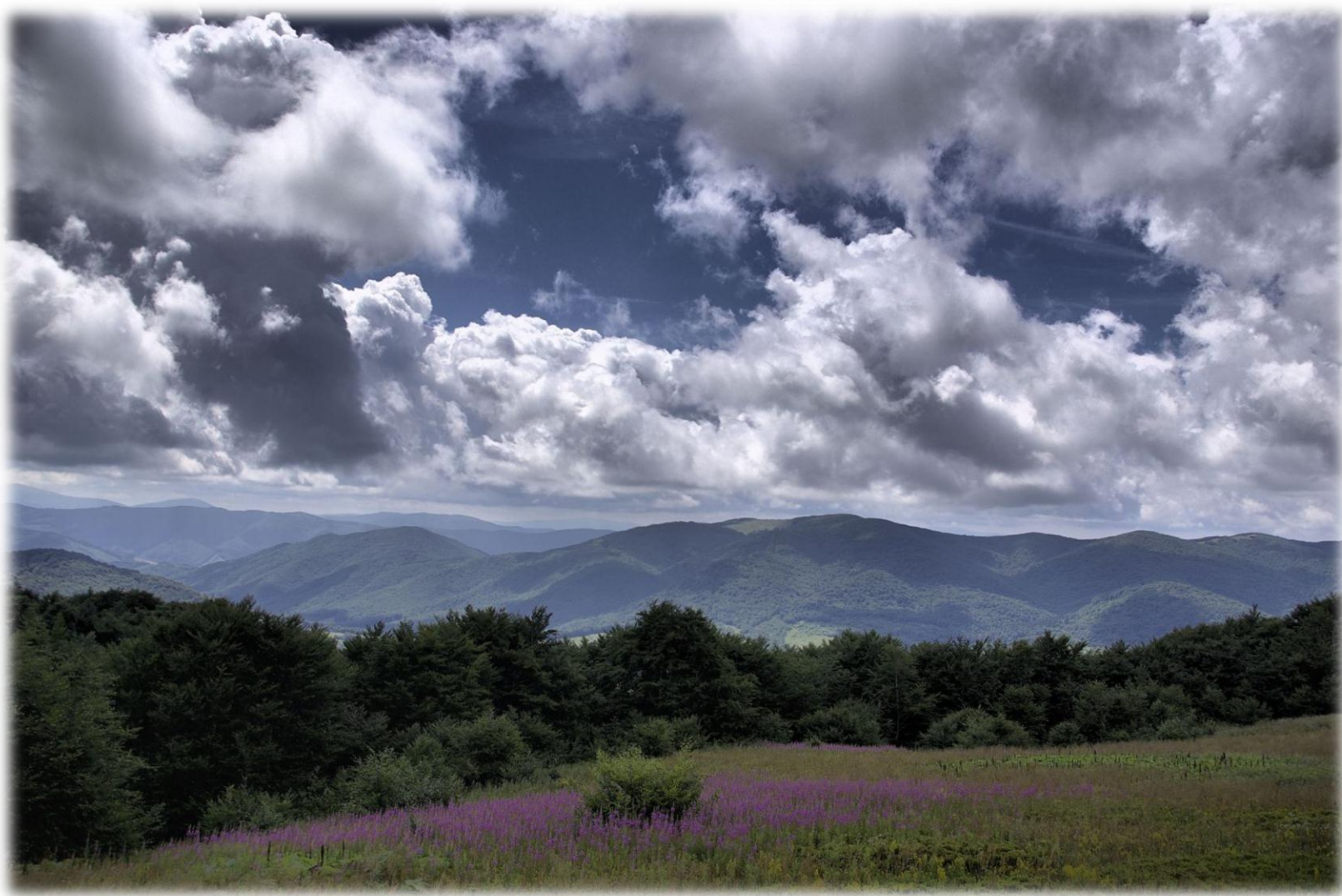
Beautiful views in Bieszczady Mountains